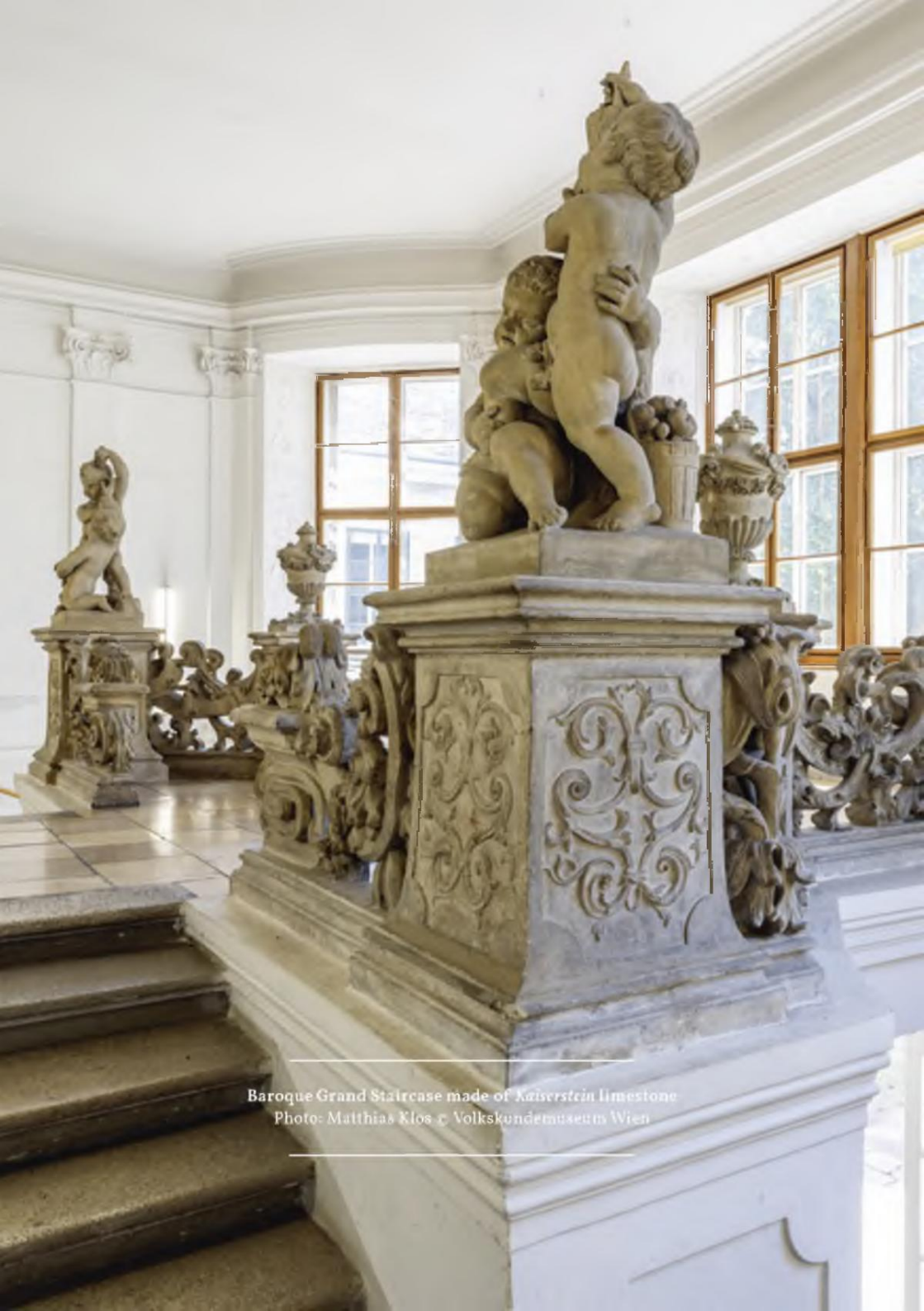
Baroque Grand Staircase made of Kaiserstein limestone