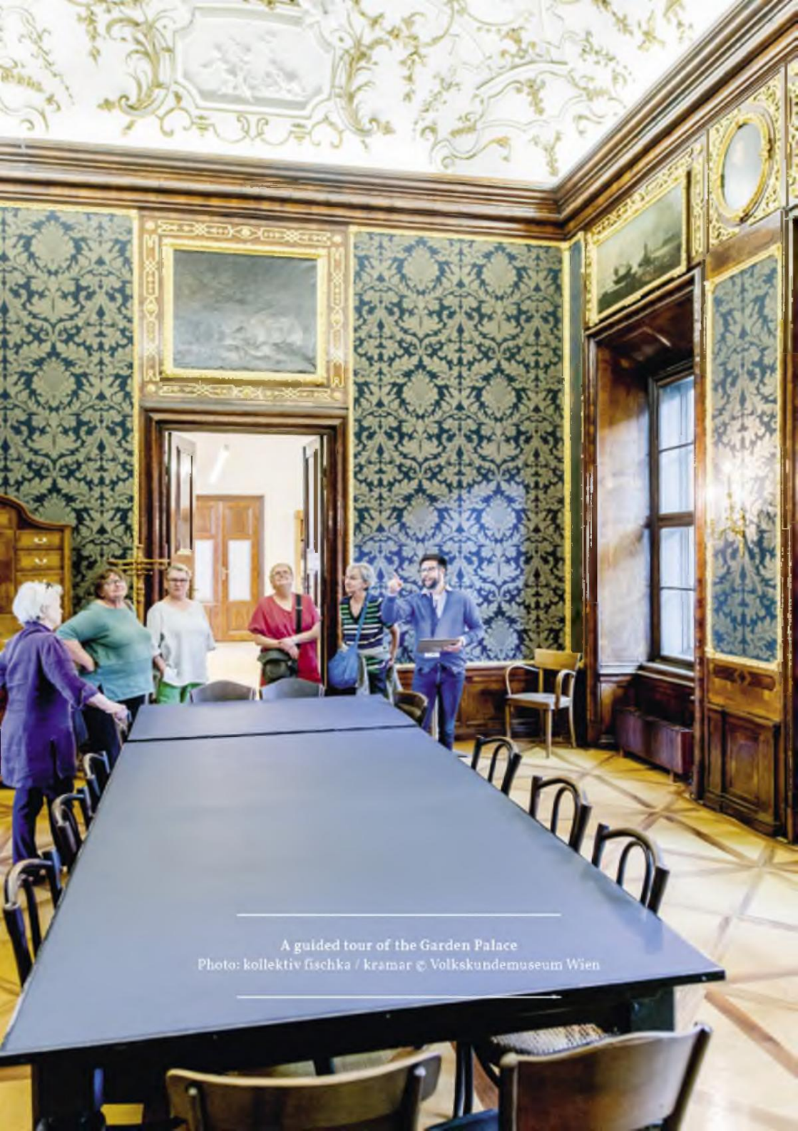
A guided tour of the Garden Palace