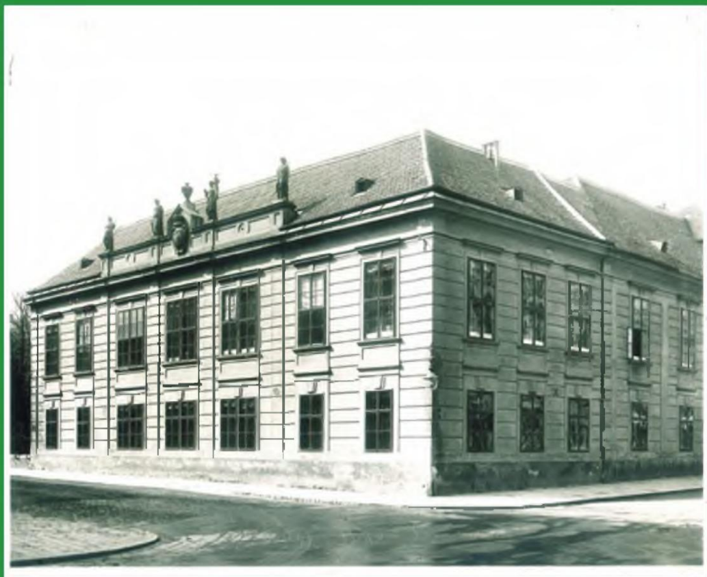
Outer façade, ca. 1900