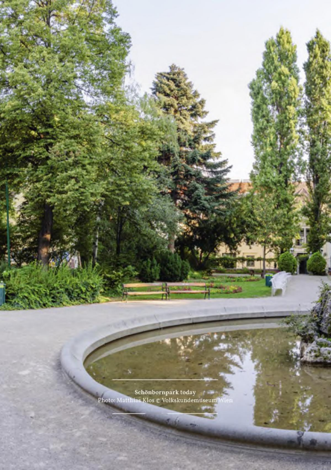
Schönbornpark today