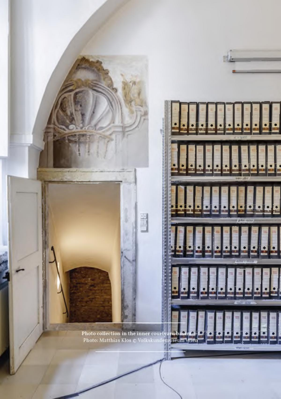
Photo collection in the inner courtyard basement