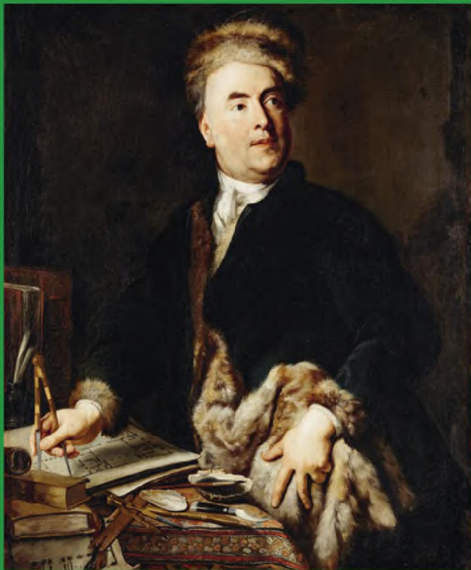
Portrait of Johann Lucas von Hildebrandt Painting by Jacob van Schuppen, ca. 1720 Painting Collection, Wawel Royal Palace, Krakow