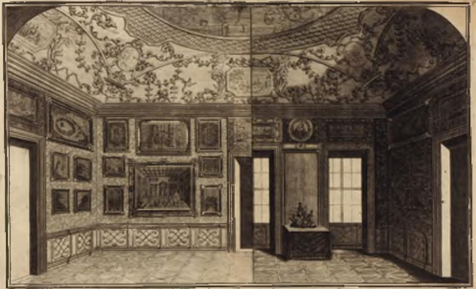
Das bildere Zimmer von Holländischen Kapfern zu Wien in dem Garten La Stanza con quadri fiammi Pitture de Maestri Fiaminghi