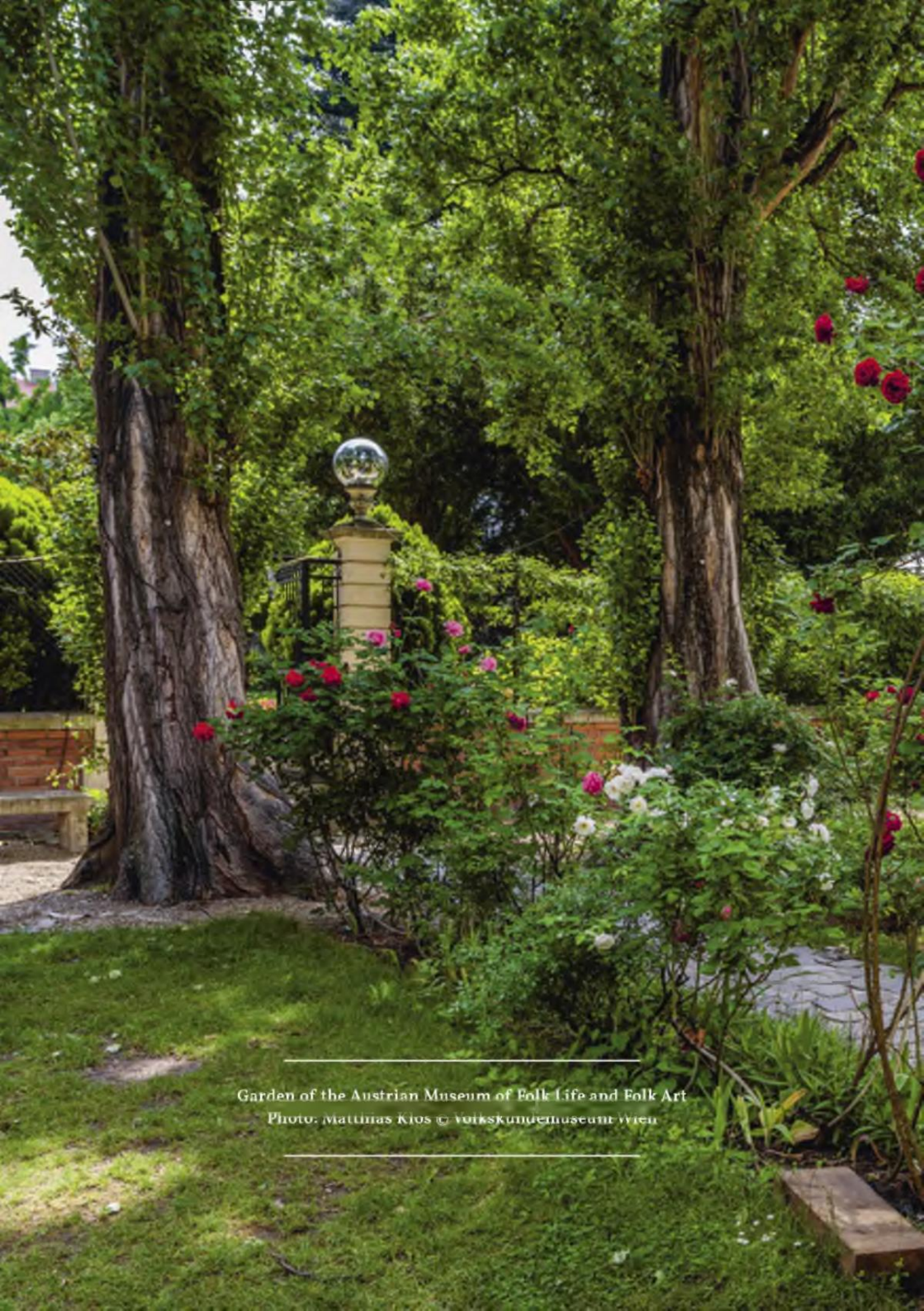
Garden of the Austrian Museum of Folk Life and Folk Art